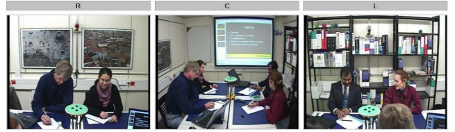
Figure 2: Example screenshot from the meeting videos which were used for annotation.

Natural non-scripted meeting data was produced in a role-play scenario where four members of a team were asked to design a remote control device over a series of sessions. Each participant was given a role such as ‘project manager’ beforehand. In each case, the participants were not requested to act in a particular way so that natural behaviour and engagement with the task and their respective roles could be captured. In addition, each session was assigned a timetable